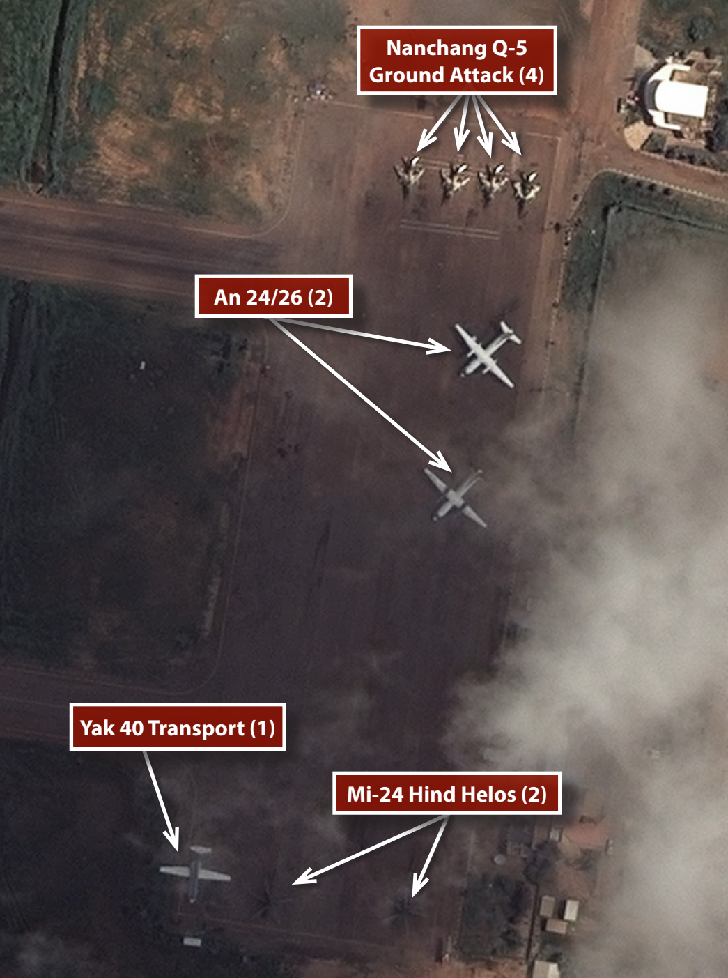
DIGITALGLOBE® DigitalGlobe Natural Color Image August 9, 2012