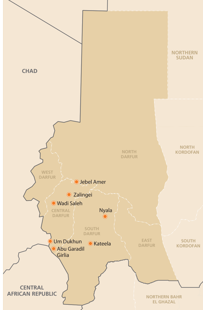
Map of Darfur highlighting recent flashpoints for conflict.

During the height of the genocide, Khartoum developed a huge security-patronage network that pays the militias to act as paramilitary units or integrates them formally into the army. 23 In the absence of oil revenues, the government is struggling to fulfill its patronage obligations. Instead of direct payments, the regime now secures its interests by allowing these militias to loot and pillage with complete impunity and keep the spoils as a form of compensation. Some sources suggest that the national-security services worked in conjunction with the Janjaweed to kidnap and hold for ransom foreign employees of nongovernmental and intergovernmental organizations, though Enough has not independently verified this information. 24 In exchange for government indifference and assistance with illegal activities, these militias continue to support the counterinsurgency against the rebels and government attempts to secure natural resources. “They loot whatever they can carry,” said Abdul, a refugee camp resident, “and burn whatever they can’t.” 25 Janjaweed forces are also reportedly benefitting from gum-arabic smuggling networks 26 and elephant poaching. 27 Government-sponsored “reconciliation conferences” are now venues for extortion by Janjaweed elements demanding huge payoffs.