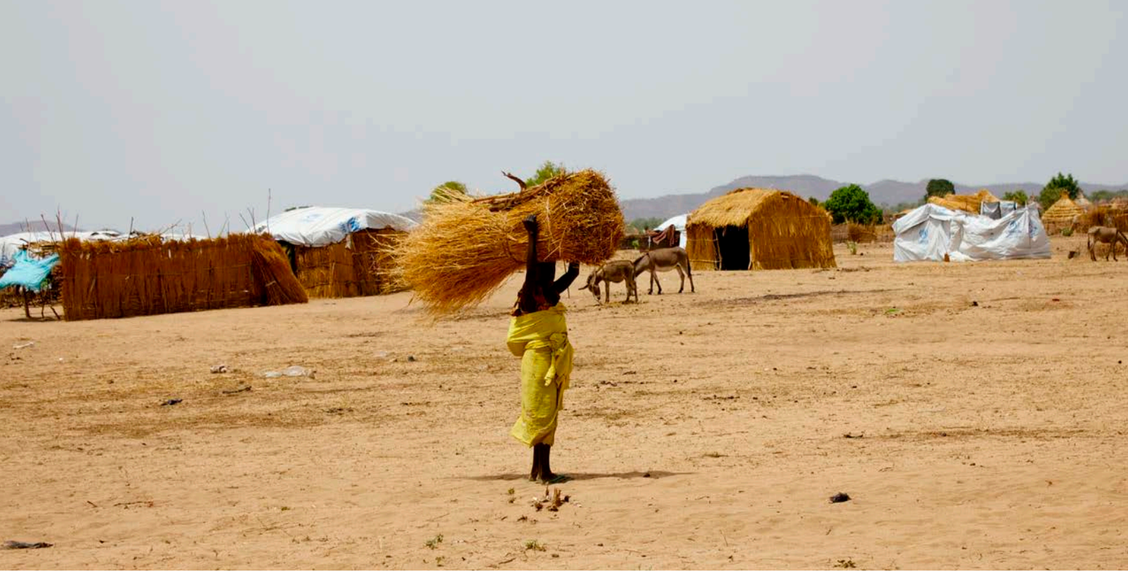
A newly displaced refugee carries materials to build a thatched hut in a Darfuri refugee camp in eastern Chad.