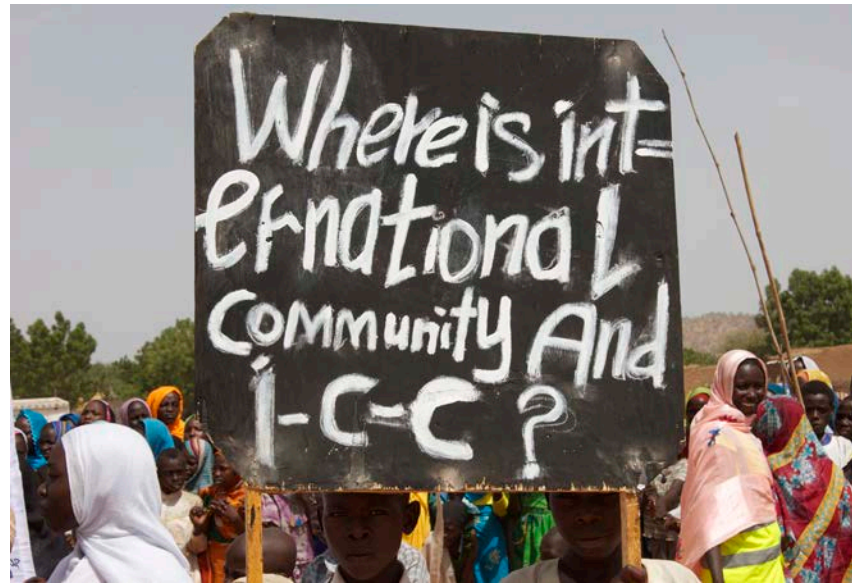
At a demonstration in a Darfuri refugee camp in eastern Chad, the refugees ask “Where is the international community and the ICC?”

Refugee witnesses to some of the attacks said that Kosheib travels in a convoy of 16 trucks with government license plates. 73 They said that his militia members wear government uniforms. Witnesses repeatedly reported that he established a camp 1 kilometer outside of the town of Um Dukhun, from which he staged looting operations and village burnings. One refugee student from Um Dukhun said that Kosheib asserted his decision that the people needed to be cleared off the land in that area. 74 The government and Kosheib “have the same head,” said the refugee. 75 Another refugee from a nearby area said that, “Ali Kosheib told the people of the area to look for somewhere else to live.” 76 Refugees described Kosheib as the center of the looting and extortion schemes described above, from demanding blood money to manipulating the reconciliation conferences to stealing grain, livestock, and other possessions. 77