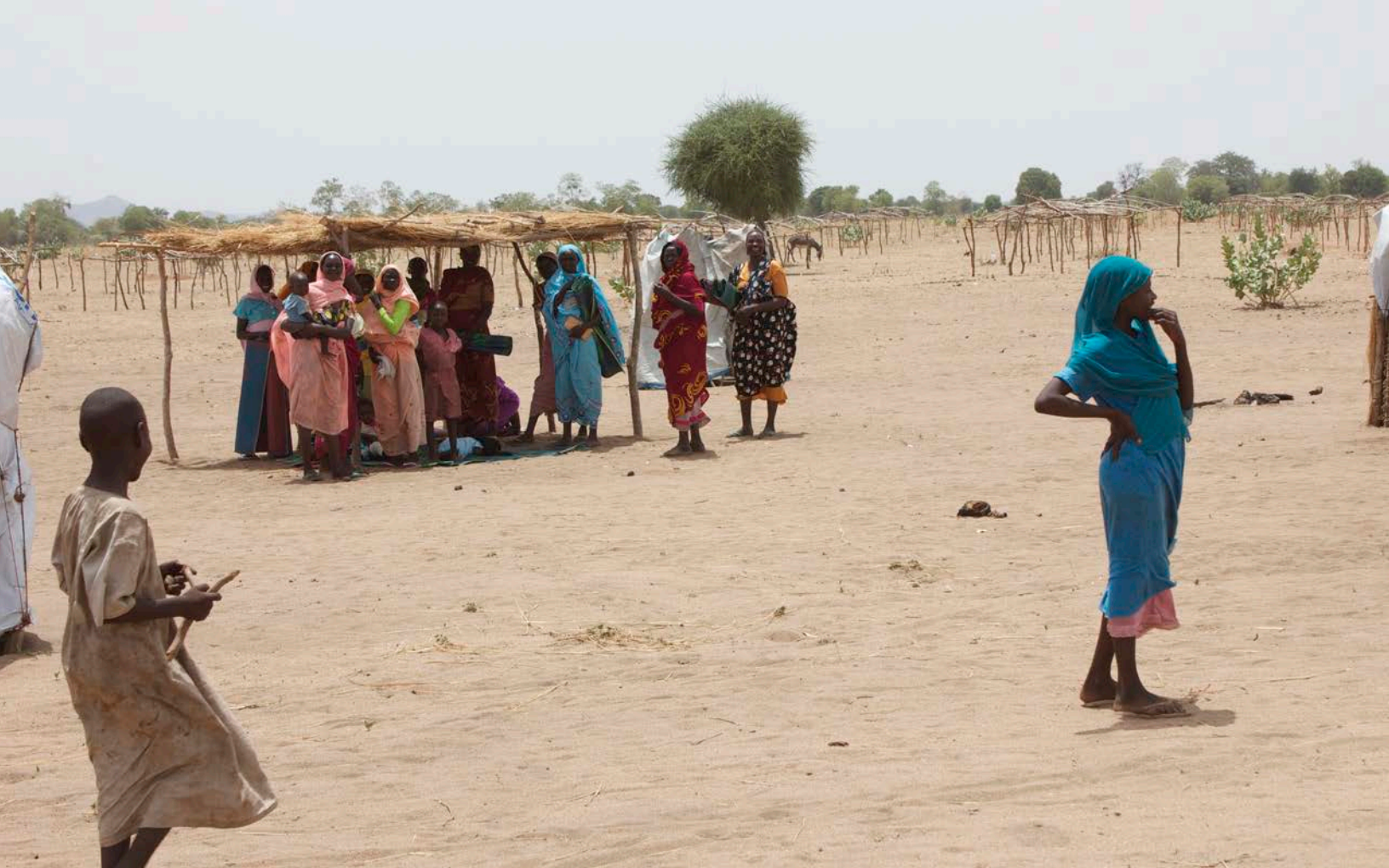
Thatched huts and temporary housing structures on the outskirts of some camps in eastern Chad show the sheer scale of the recent displacements.