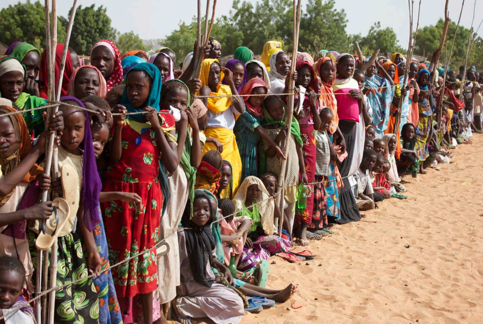
Darfuri youth line up along a fence in a refugee camp in eastern Chad.