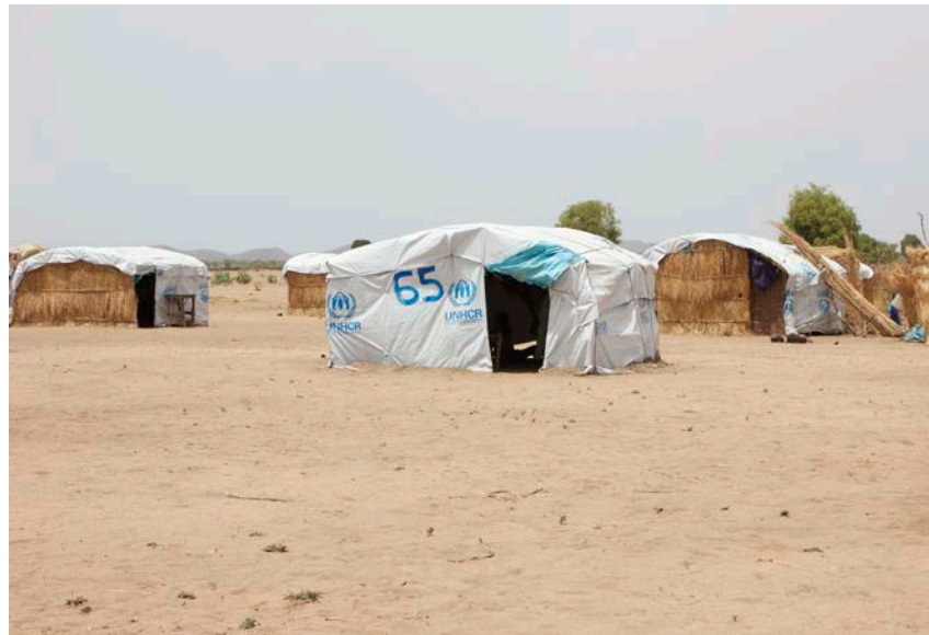
UNHCR has been forced to establish an entirely new camp to meet the needs of the newly displaced.

After an early bout of fighting in Um Dukhun, militias from both sides—Salamat and Misseriya—left town. The Misseriya established a camp a couple of kilometers out-