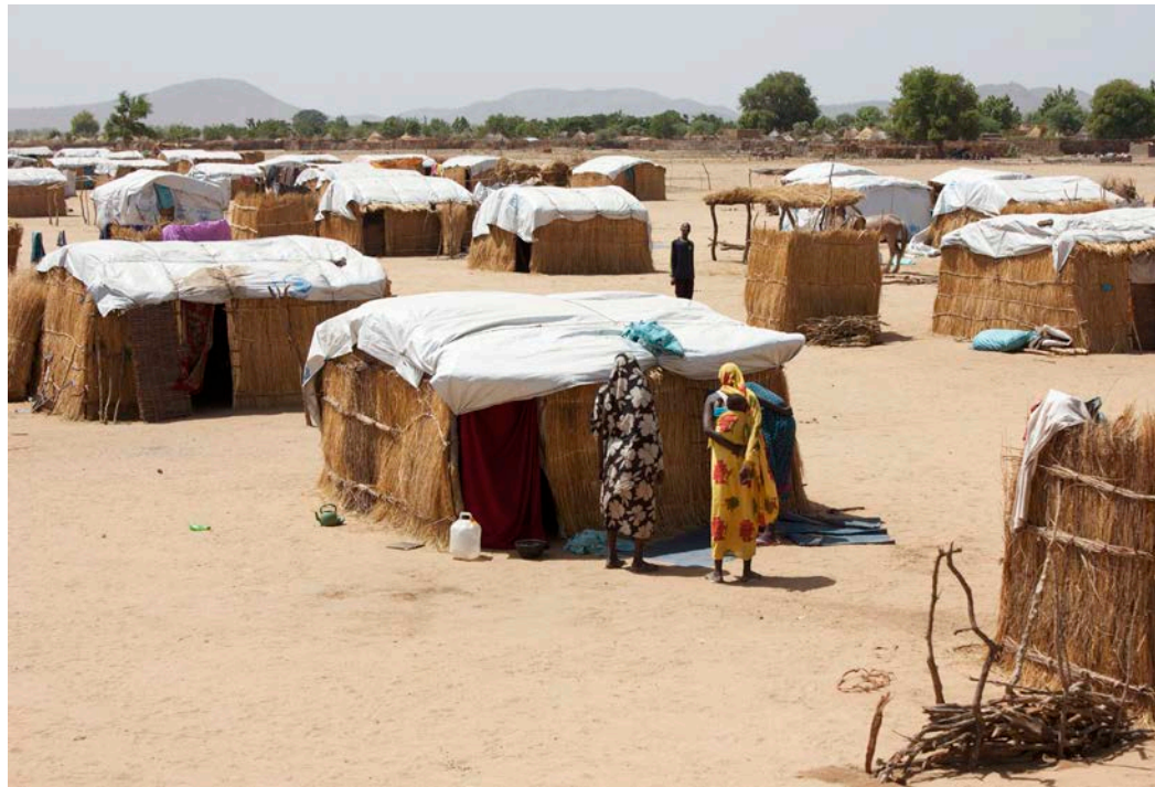
Refugees are constructing thatched huts and temporary housing structures on the outskirts of some camps in eastern Chad. UNHCR is also establishing an entirely new camp to meet the needs of the newly displaced.

would have otherwise succumbed to hunger and preventable diseases. Despite this success and the unprecedented outpouring of concern in the United States and other countries, the broader international response to the state-sponsored genocidal violence in Darfur beginning in 2003 has been woefully ineffective. The reasons for the policy failure are rooted in the lack of an effective, truly comprehensive peace process for Sudan and an unwillingness in most countries with leverage to use it to pressure Khartoum to change its behavior on the battlefield and compromise at the negotiating table. 78